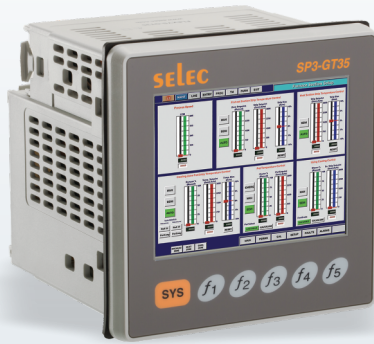
99 x 99 x 62.85mm